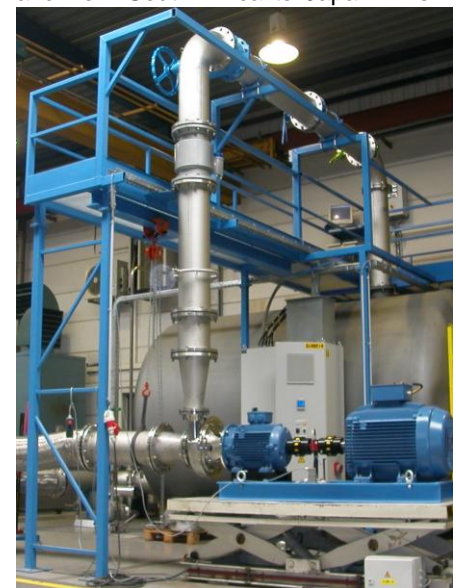
Illustration 1. Test station with 300 mm bore pipes and a 110 kW frequency converter for pumps with a flow rate of up to 1000 m 3 /h.

We build over 11,000 pumps a year. They are sent all over the world. Most of them stay in Europe, though, where we are represented by our 30 distributors in virtually every country. All the distributors are firms with added value in terms of both pumps and pump applications. We also have 15 active dealers on the other continents, from Canada to Chile and from South Africa to Japan. The