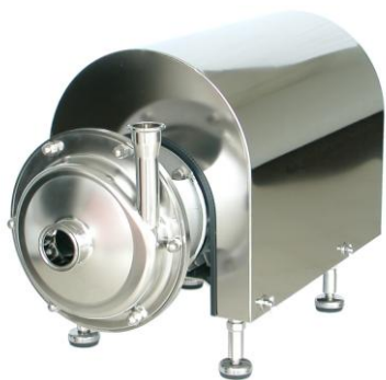
Packo stainless steel centrifugal pump type FP2

distributors are vital for the constant growth we have experienced for the past 20 years, and we regard it as our top priority to give them technical and commercial support. A highly effective pump selection package has been developed especially for this purpose. Among other things, it includes pump curves, parts lists, detailed drawings and photos together with some 20,000 DXF drawings of pump units. You can also calculate the pipe resistance in an installation or curves at variable rotational speed for different viscosities and many other things besides. It's probably the most complete selection package on the market.